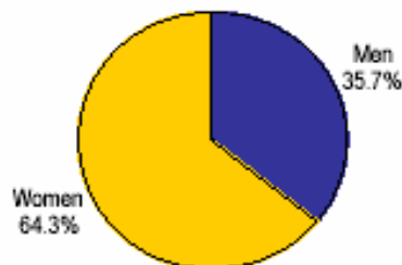
Listeners 18+ Mon-Sun, 6AM-Mid